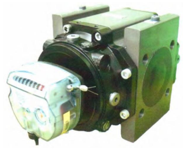
Figure 1 - RSG SIGNAL general drawing

g) lubrication system with plug for oil filling oil-level indicator.